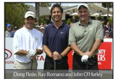
Doug Flutie, Ray Romano and John O'Hurley