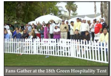
Fans Gather at the 18th Green Hospitality Tent