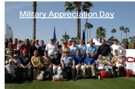
Military Appreciation Day

Your business can help serve the San Diego community while you strengthen your brand among a core group of influential San Diego military family members. Your participation will directly enhance the "Quality of Life" for our Military families!